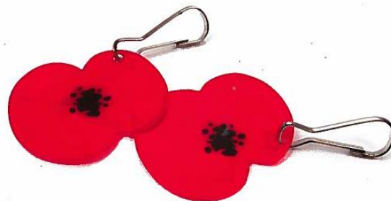
Reflector – Suggested Donation: 50p