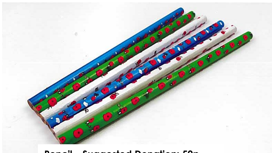
Pencil – Suggested Donation: 50p