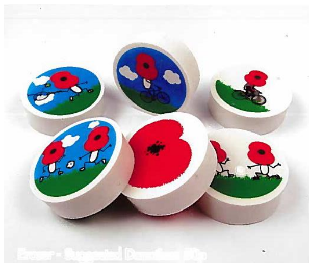
Eraser – Suggested Donation: 50p