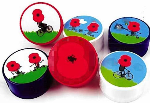
Pencil Sharpener – Suggested Donation: 50p